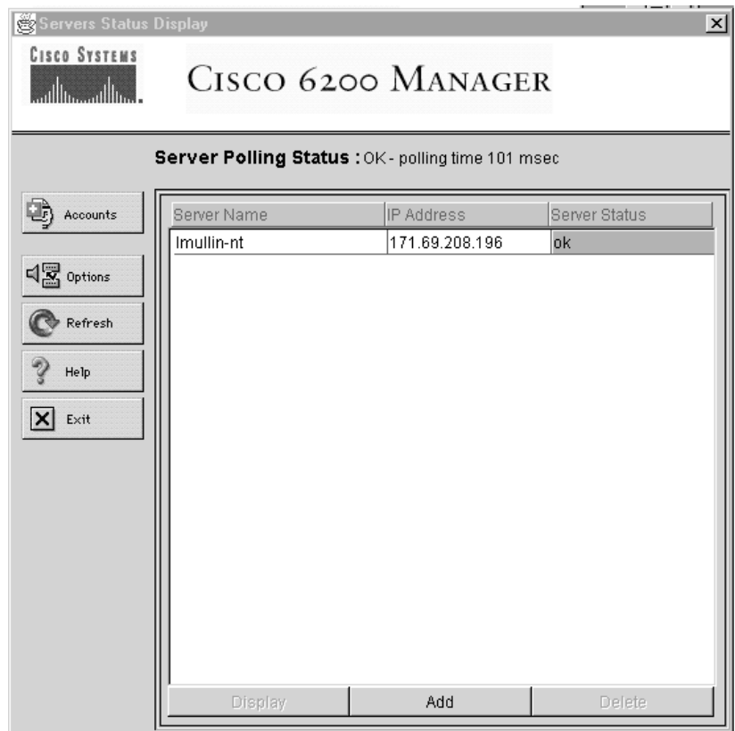
Figure 3 Server Polling Status Window

Step 7 Click Create . The Server Polling Status window appears (see Figure 3).