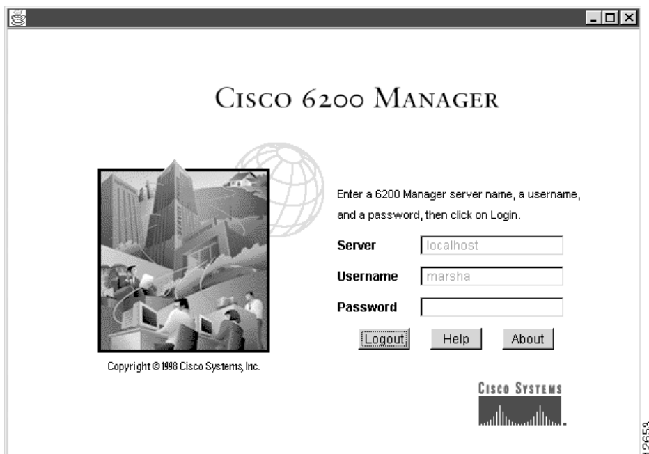
Figure 1 Cisco 6200 Manager Login Window

Note A local or remote server application must be running in order for you to complete the login procedure.