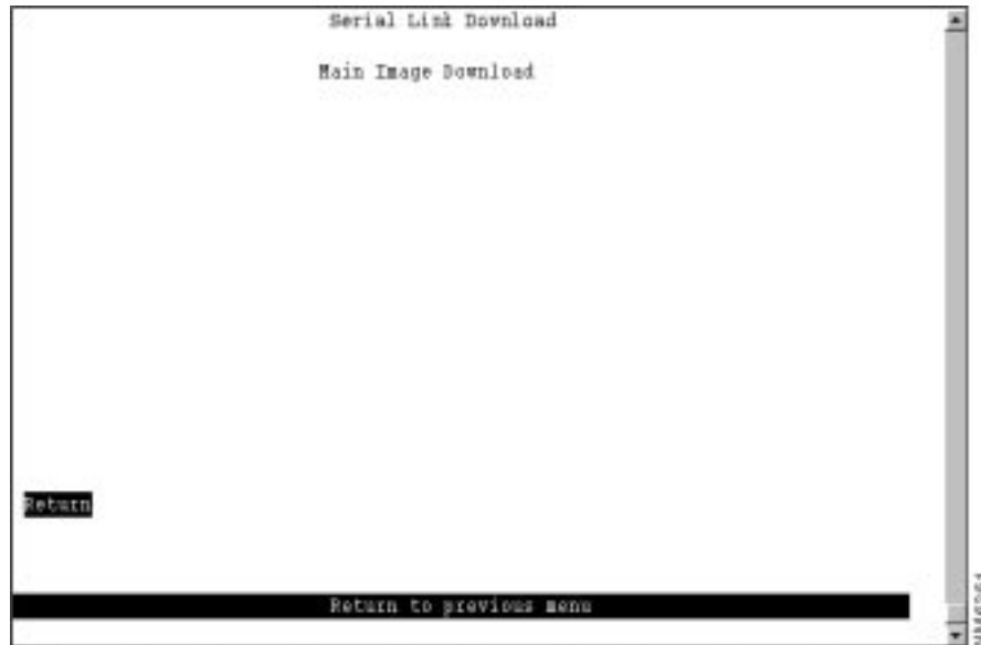
Figure 9-6 Serial Link Download Panel