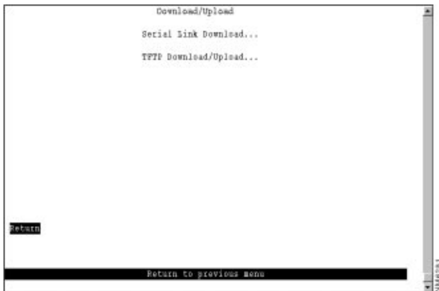
Figure 9-1 Download/Upload Panel

Step 4 Select TFTP Download/Upload . The TFTP Download/Upload panel (Figure 9-2) is displayed.