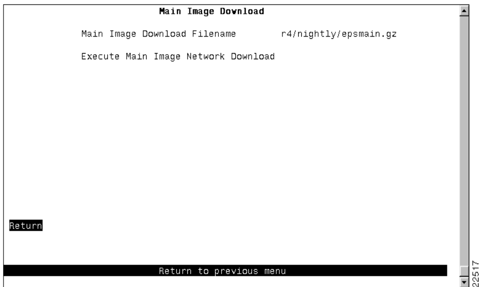
Figure 9-3 Main Image Download Panel