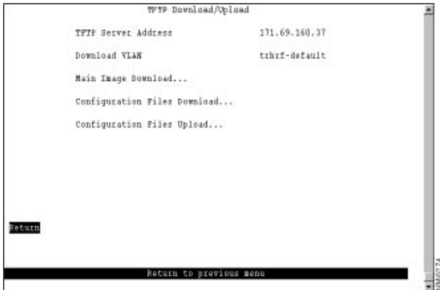
Figure 9-2 TFTP Download/Upload Panel